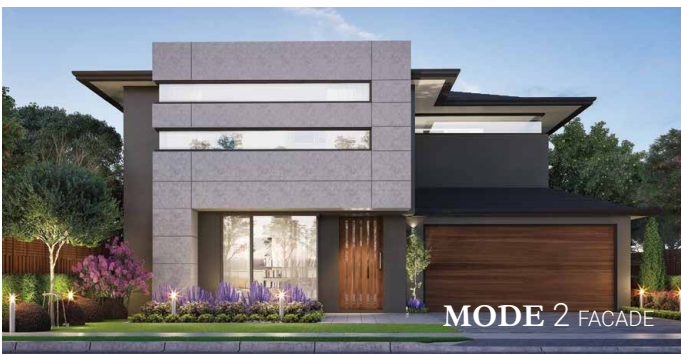
MODE 2 FACADE