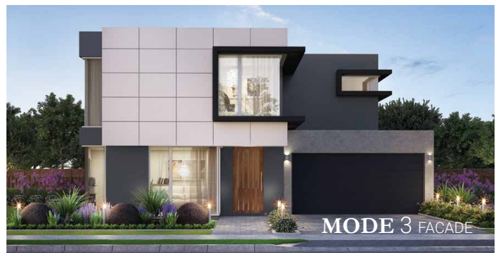
MODE 3 FACADE

Select from three impressive facades – Georgian, contemporary and modernist – each as stylish, warm and welcoming as it is functional. The roomy interior is in equal parts lavish and inviting, featuring clever touches that make all the difference like a home cinema and study. While welcoming alfresco doors lead to an area equally suited to relaxing and entertaining with family and guests. With all-important details like fine joinery and a clever use of space, this home has a feeling of intimacy and connection that belies its 54-square size.