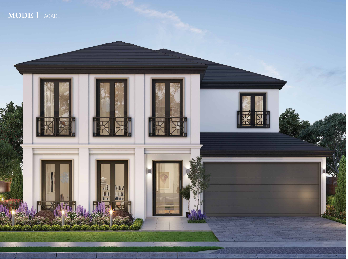
MODE 1 FACADE